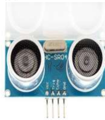
Figure 1: Ultrasonic Sensor