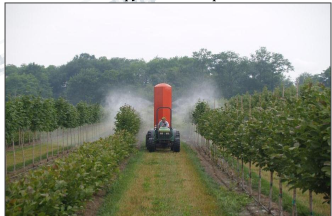
Fig. 3 Overspray of a nursery sprayer when using the same setting to treat different size crops in the same production line