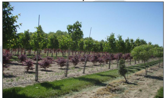
Fig. 2 A typical nursery production plot with different canopy sizes and shapes