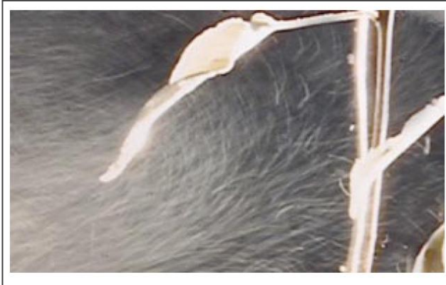
Fig. 5 Electrostatically charged spray droplets reverse direction and defy gravity to coat stems and the undersides of leaves.