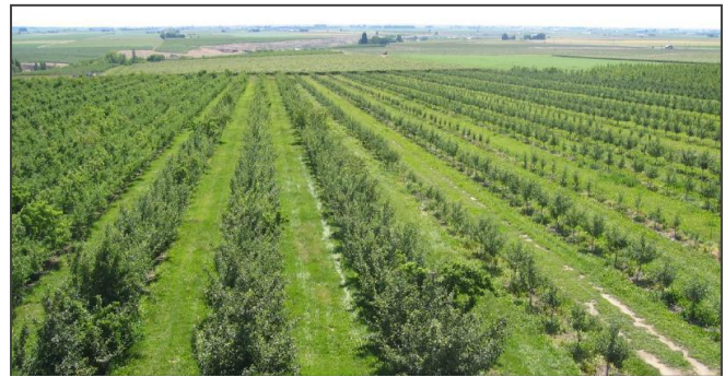
Fig. 1 An apple orchard with different sizes of tree canopies

The variable-rate spraying can be used with or without a GPS system. The two basic technologies for variable-rate spraying are map-based and sensor-based.