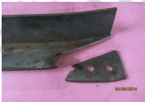
Fig 2. Partial Net Section Rupture Followed by the Tearing of Leg (Specimen 5)

The typical specimen failure (specimens: 2, 3, 5, 6, 8, 9) consisted of a partial rupturing of the net section followed by the tearing of the web. The peak load was reached before fracturing of the full net section, but after rupture of the partial net section. Fracturing of a specimen's web initiated at the lead bolt hole and propagated to the web's outside edge. Necking down of the tension plane area preceded fracture. Specimens with small eccentricities exhibited a significant amount of bolt hole deformation. However, it was observed that the amount of deformation decreased with increasing eccentricity. Those specimens with the largest eccentricities demonstrated very minor hole deformation. Figure 2 shows a typical partial net section failure.