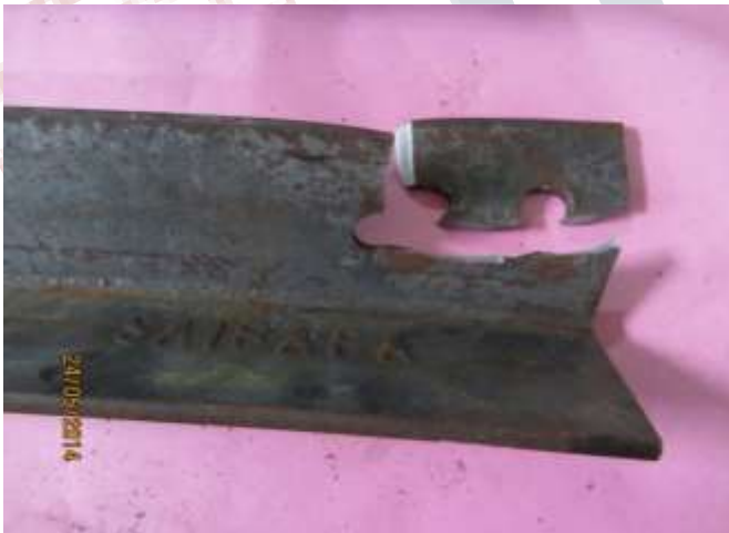
Fig 5. Block Shear Failure (Specimen 4)

Block shear failure occurred in specimens 4 which had a near zero eccentricity. The specimen failed in block shear by a partial rupturing of the net shear area. Figure 5 shows a typical block shear failure mode.