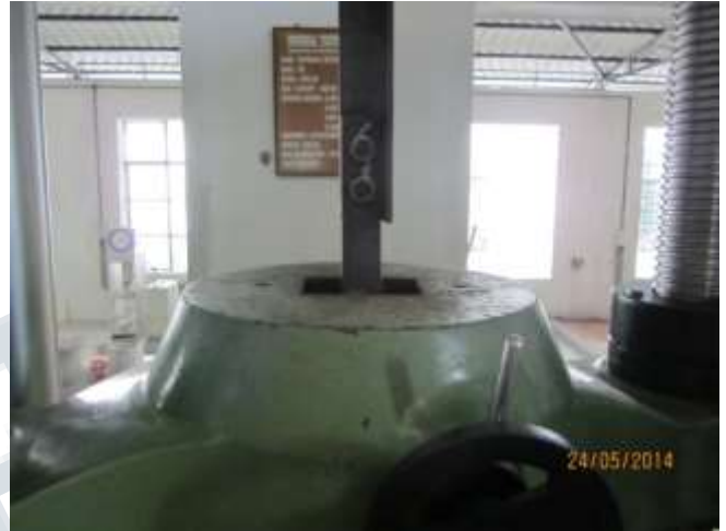
Fig 1. ISA specimen clamped in UTM jaws

After the appropriate grips were fastened to a ISA section the specimen-grip assembly is to be then placed and centered in the UTM and then secured fast with the wedge-grips in the UTM crossheads. Each specimen is to be tested to failure (at which point the load applied by the UTM would drop off considerably) by steadily increasing the applied load. Figure 1 shows a typical ISA specimen held in UTM.