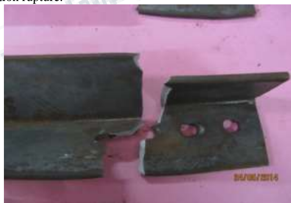
Fig 4. Full Net Section Rupture (Specimen 7)

Full rupture of the net section occurred in specimens 7 which had a near zero eccentricity. There occurred a rupturing of the leg on either side of the lead bolt hole, which propagated through the rest of both the leg areas simultaneously. Figure 4 shows specimen 7 failed in full net section rupture.