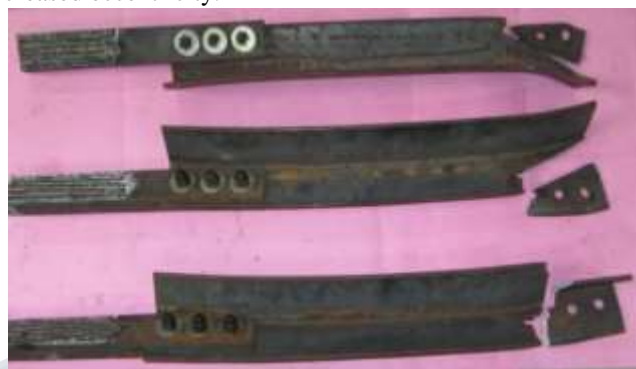
Fig 3. In-plane Bending of the Specimen

specimen were resisted by the specimen's connections and thus the deformation patterns observed. The resisting moment of the connection was centered about the connection length's centre. The evidence of this connection rotation, as given bolt hole deformation patterns, decreased with decreased eccentricity.