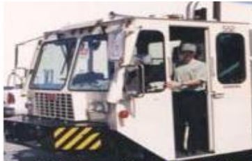
Berkeley Curbside Recycling Trucks Now Fueled by Recycled Vegetable Oil

Biodiesel commonly known as liquid fuel which is typically made up of chemical reaction of alcohol with vegetable oils, fats and greases which are thrown from hotels some other commercial building. Nowadays it is commonly used in mix of 20 percent (B20) biodiesel and 80% fossil fuel. There is also so call neat biodiesel in which 100% biodiesel is in used.