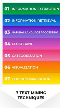
Figure 2: Useful techniques of text mining [3]

Text summarization - The text summarization gives the overall perception of the text documents. In other words, it also helps to describe the frequency, position and suggest the most effective information from the exact sentence.