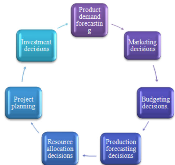
Figure 1: Different situations to use model driven DSS

Model driven is computerized techniques which can maintain accounting and financial activities that are able to accelerate decision making process. Product demanding forecast, credit and lending of decision, marketing decision, resource allocation, marketing decision, project planning and investment decisions are some processes of model driven DSS [11]. This type of decision making is not data intensive, rather this is used as a parameter in the decision makers which lead the variety with huge integration based on web application. There are various situations which are especially handled with the assistance of model driven design making such as: budgeting decision, production forecasting, lending decision and planning of new project [12]. Model driven process in DSS is mainly done on the basis of two categories such as: dynamic and static analysis.